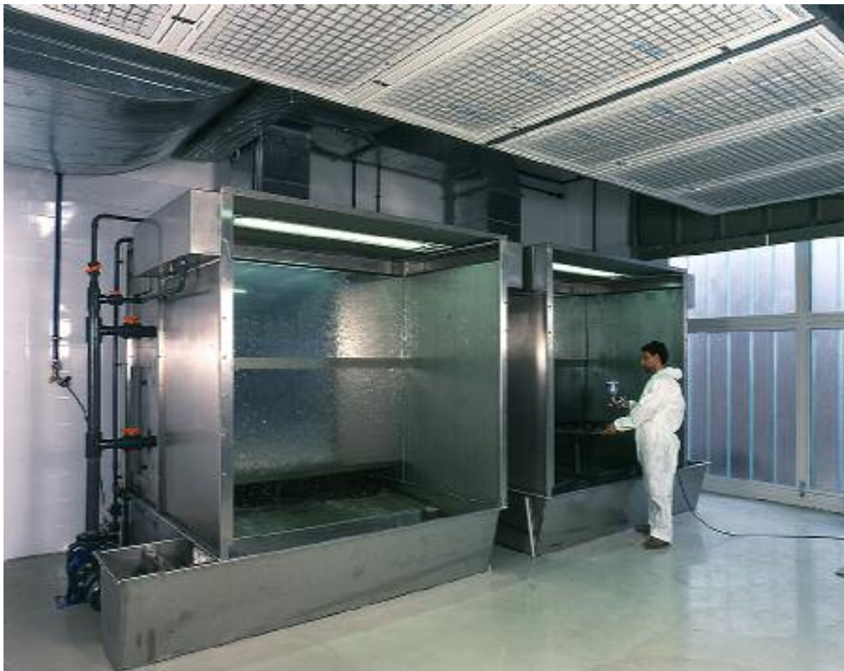
Water-flowed Spray Cabin